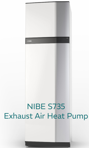
NIBE S735 Exhaust Air Heat Pump